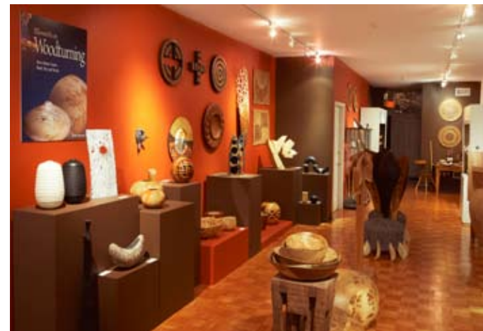
Wood Turning Center Museum Store.

The most exciting initiative for the Museum Collection, library and archives is the development of a web-based database which will showcase each item contained within the Museum Collection, artist files and library. The redesigned database and website will be accessible to the public and are expected to launch by early 2012. A more detailed description of the project is contained on the following page.